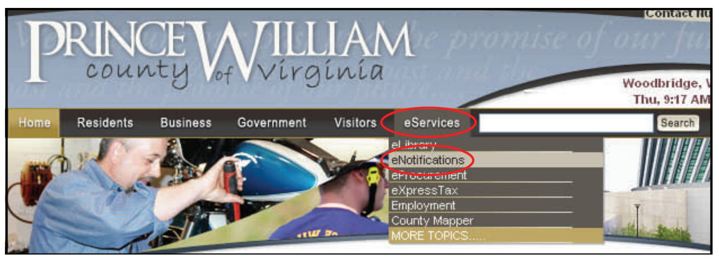
Go to PWCGOV.ORG and "click" eServices then eNotifications

Prince William County Development Agencies are pleased to present "The Alliance," our newsletter for industry professionals. We chose to brand the newsletter "The Alliance" to signify the collaboration with our industry partners in the development process. The Alliance is a collaborative effort among the Departments of Development Services, Public Works, Fire and Rescue, Transportation, the Department of Information Technology, and the Planning Office. The Alliance is published on a quarterly basis to highlight performance data and process improvements to the development community.