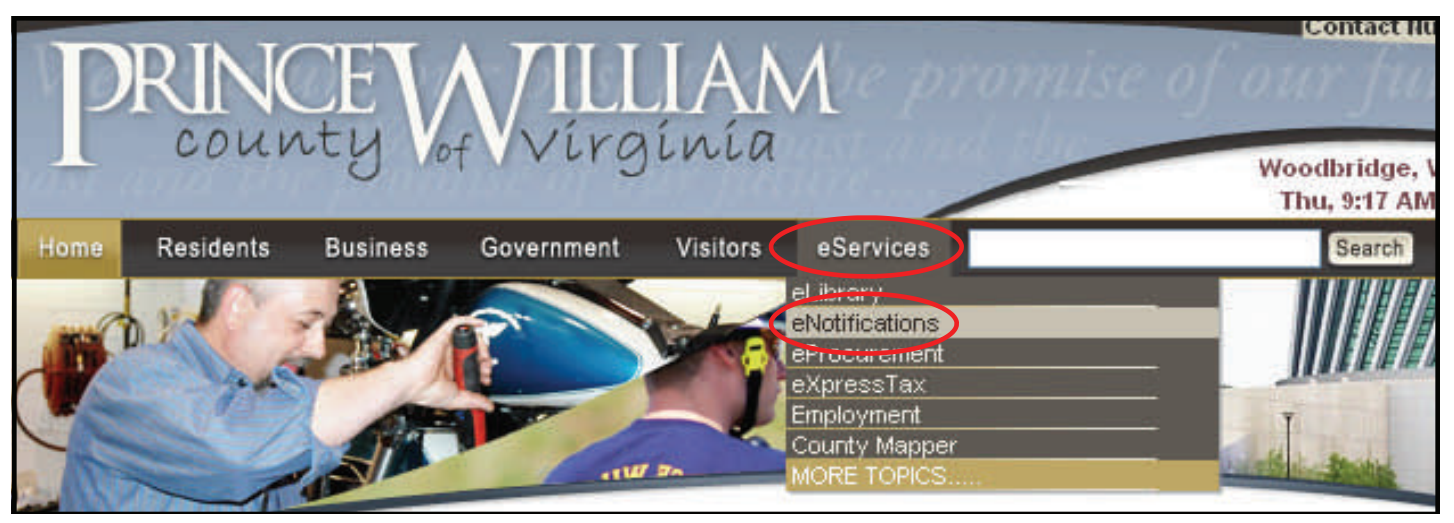
Go to PWCGOV.ORG and "click" eServices then eNotifications

Prince William County Development Agencies are pleased to present "The Alliance," our newsletter for industry professionals. We chose to brand the newsletter "The Alliance" to signify the collaboration with our industry partners in the development process.