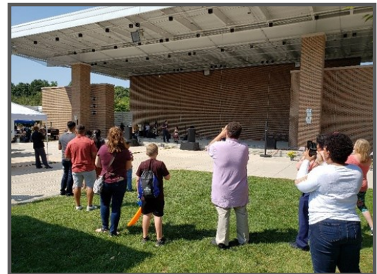
Make the Right Call at Public Safety Day

On Saturday, September 21 st , we celebrated Public Safety Day. This year offered more events than in years past, and was well attended by the local community. In addition to featuring our wonderful first responders and supporting agencies, this year featured live music and a CPR station