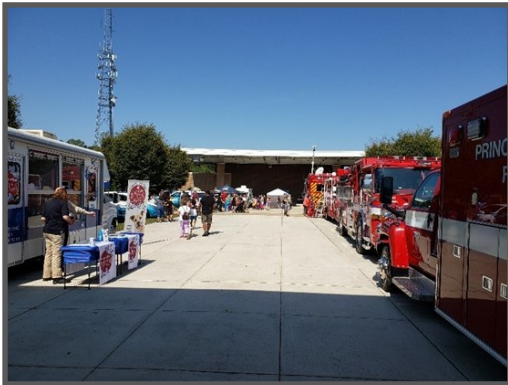
Public Safety Day on the Plaza

EM Staff also presented at a senior luncheon in the Town of Dumfries at the Community Center on Friday, September 20 th . This was a wonderful opportunity to speak with residents of Dumfries about preparedness in Prince William County and to describe what the EM program does.