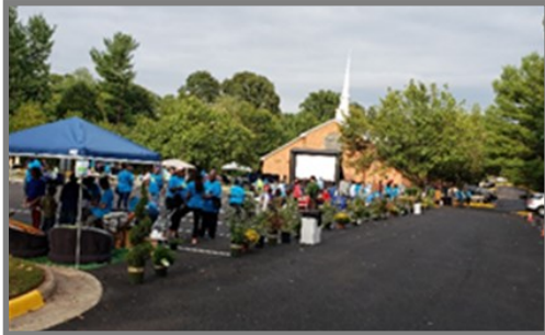
AME Church Community Event