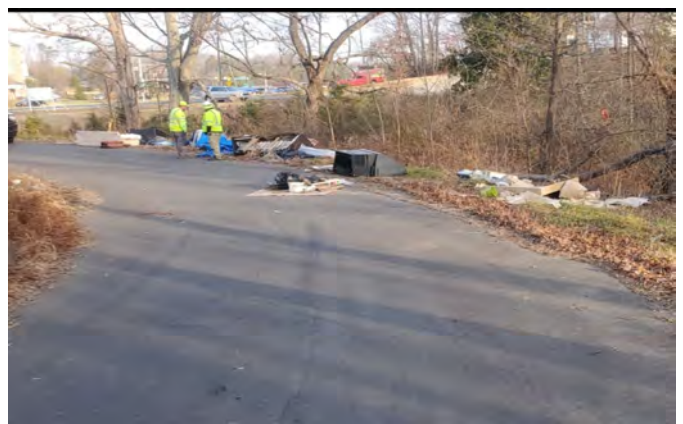
BEFORE THE LITTER CREW...