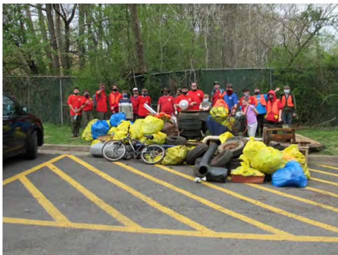
Boy Scout Troop 964 at Powells Creek

PWC Marine Debris Project - Prince William Soil and Water Conservation District