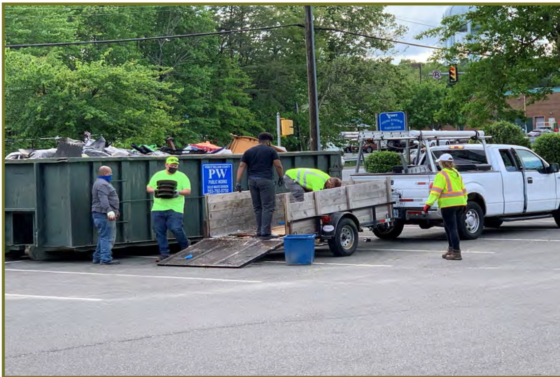
Dale City Dumpster Day Gemini Way Commuter Lot May 8, 2021

To learn more about National Waste and Recycling Workers Week, and how to show support, go to https://www.wasterecyclingworkersweek.org/ . Celebration ideas and photos may be sent to PWCRecycles@pwcgov.org .