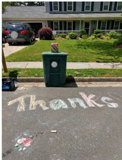
PWC family share a treat and a big "Thanks" in 2020.

In addition to collecting trash, solid waste industry employees are also pioneers in advancing technologies such as recycling, renewable and sustainable energy, and reduction of fossil fuel dependence. Match that with their clear impact on community cleanliness and hygiene, and it seems the modern-day garbage man should receive more than our garbage every week.