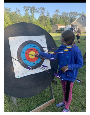
PWC 4-H'ers interested in learning more about our Shooting Sports Education Program should contact Alan Lerch.