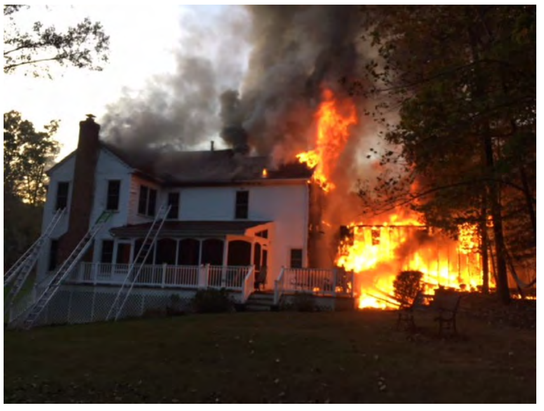
Photo from Washington Post: <u>Two separate fires in Prince William County cause families to be displaced - The Washington Post</u>