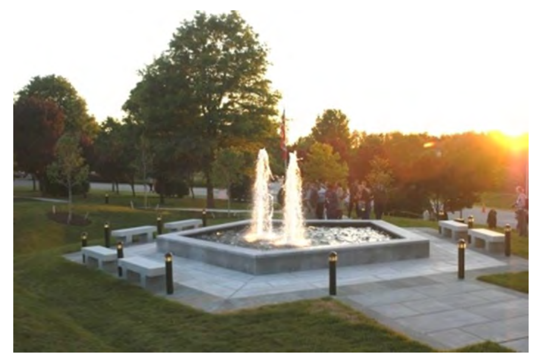
A memorial to the 22 Prince William County residents who died at the Pentagon on Sept. 11, 2001 sits on the grounds of the County's complex.

The Prince William Board of County Supervisors will host a remembrance service to mark the 20<sup>th</sup> anniversary of the September 11 terror attacks. This event is open to the public.