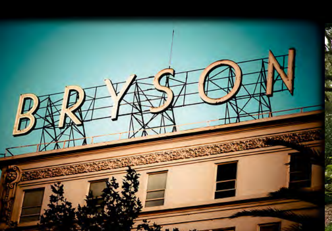
Bryson Apartment Hotel, Los Angeles County, CA