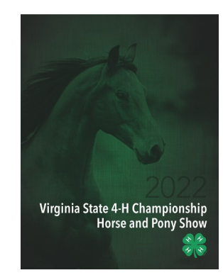
Click here for information packet.

Please have all funds collected and submitted to your Extension office at the time of your State Show entry submission/orientation meeting on or before July 18. Entries will be online this year – more info to come soon on that! Please check with your Extension agent about when your State Show orientation meeting will be.