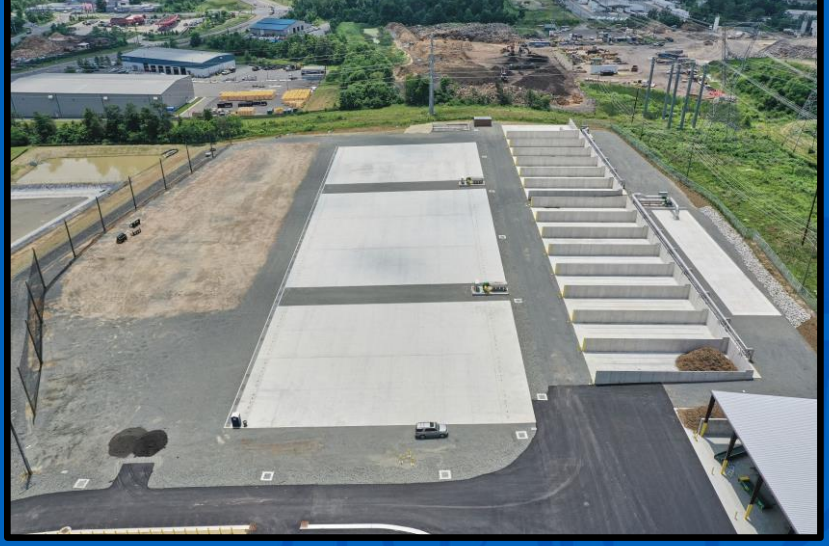
Prince William County Landfill 14811 Dumfries Rd., Manassas