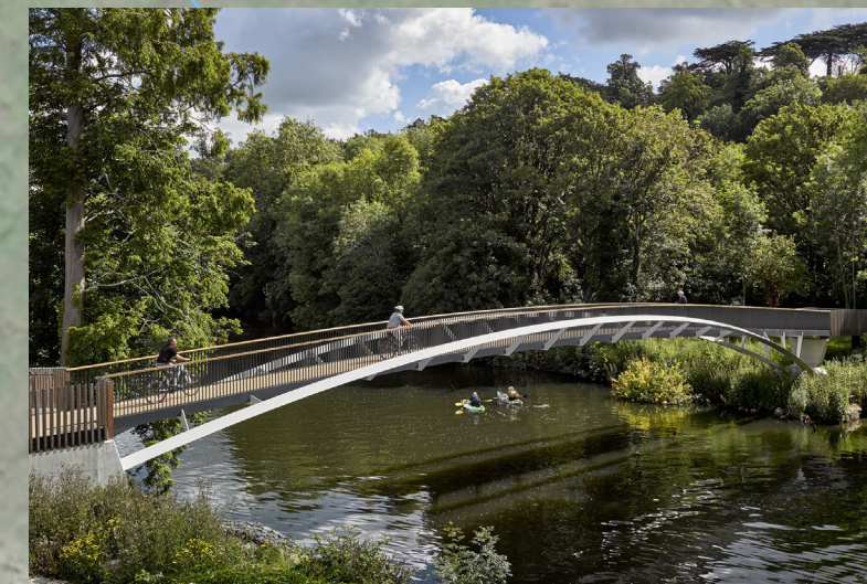
Pedestrian Bridge - Lake Jackson