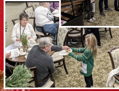
Cookies & Caroling with Nokesville 4-H Club at Capitol Ridge Gracious Retirement Living

Prince William 4-H'ers know that the best way to spread Christmas cheer is singing loud for all to hear!