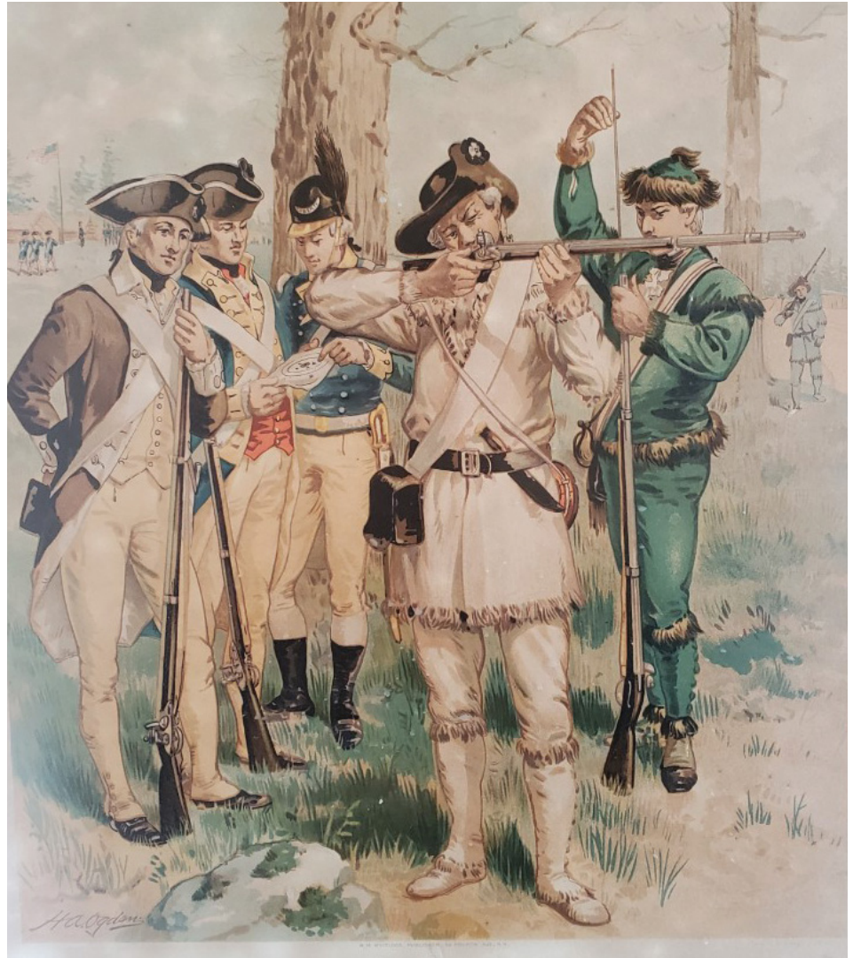
Prince William County Office of Historic Preservation