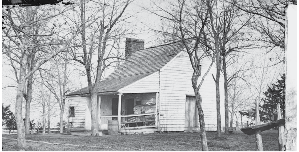
Robinson House, National Park Service

It was common for free blacks to serve a period of indentured servitude in order to learn a marketable trade. Based on