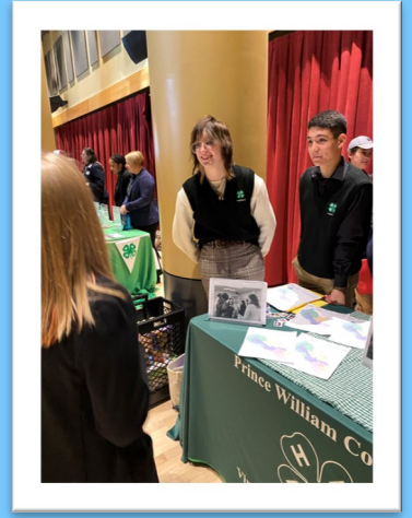
Prince William 4-H Meet and Greet Table