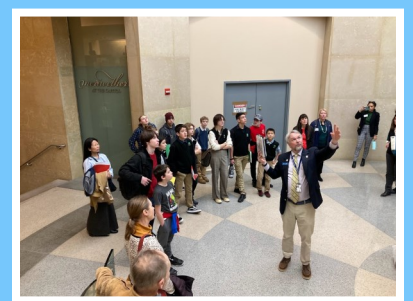
[I learned that] "Thomas Jefferson designed the Capitol building and got inspired by French buildings."