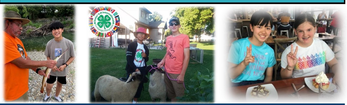
Host a Japanese youth in Summer 2023 through States' 4-H International!

Host a delegate in your home this summer and give your family a global perspective!