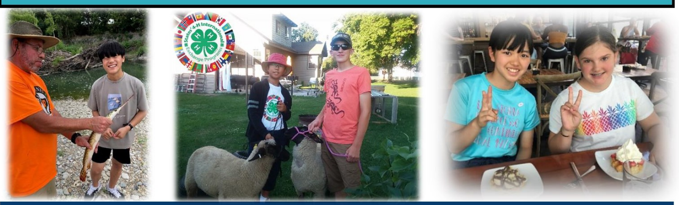
Host a Japanese youth in Summer 2023 through States' 4-H International!

Host a delegate in your home this summer and give your family a global perspective!