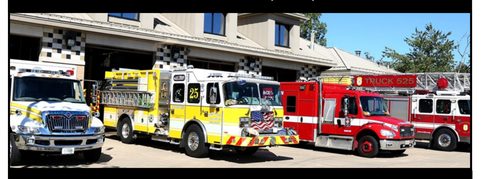
STATION 25 — NOKESVILLE VFD (LINTON HALL)