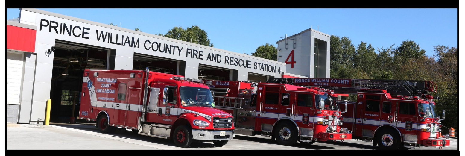
STATION 4 — PWCDFR (GAINESVILLE)