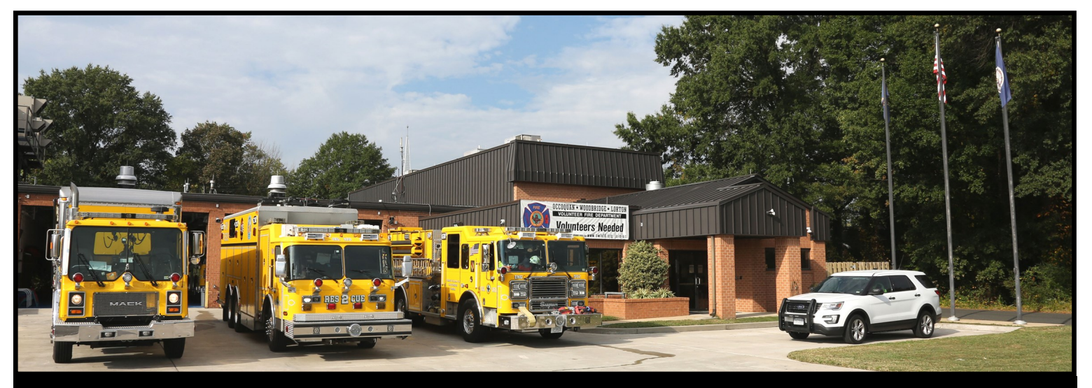
STATION 2 - OCCOQUAN-WOODBRIDGE-LORTON VFD (BOTTS)