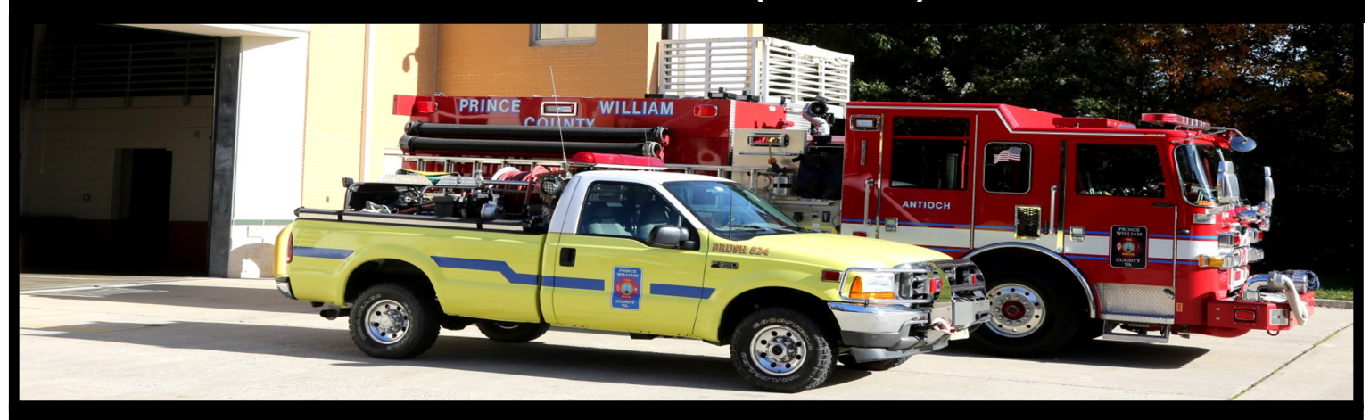
STATION 24 - PWCDFR (ANTIOCH)