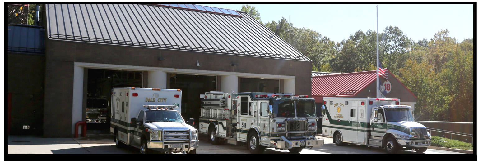
STATION 18 — DALE CITY VFD (PRINCEDALE)