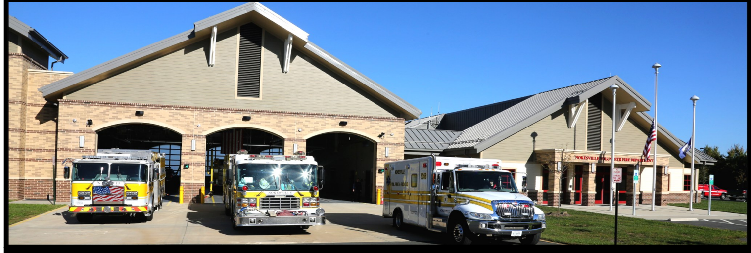
STATION 5 — NOKESVILLE VFD