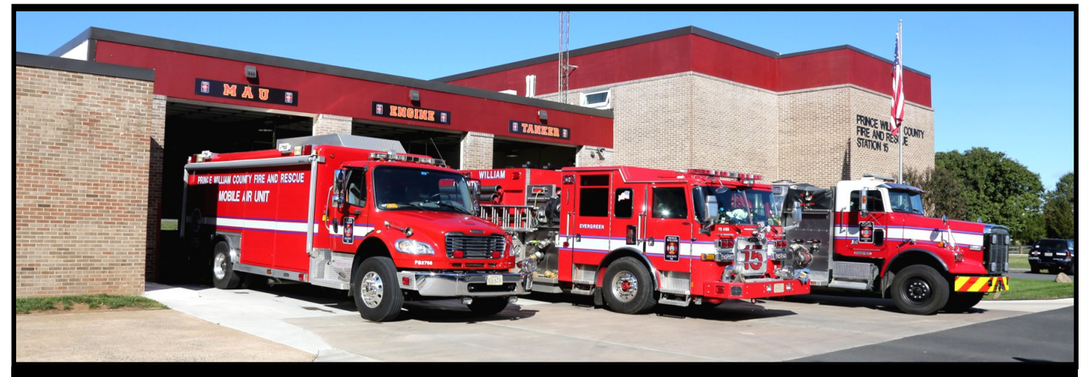
STATION 15 — PWCDFR (EVERGREEN)