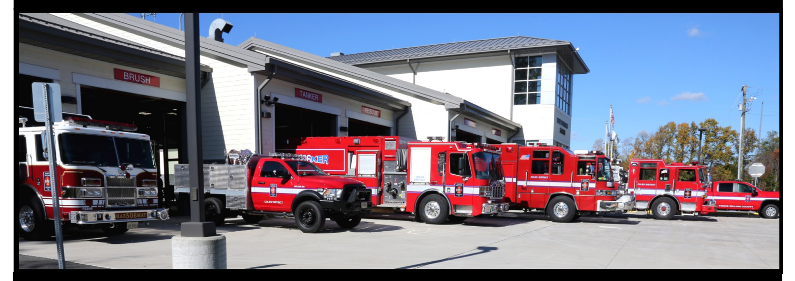
STATION 6 - PWCDFR (COLES DISTRICT)