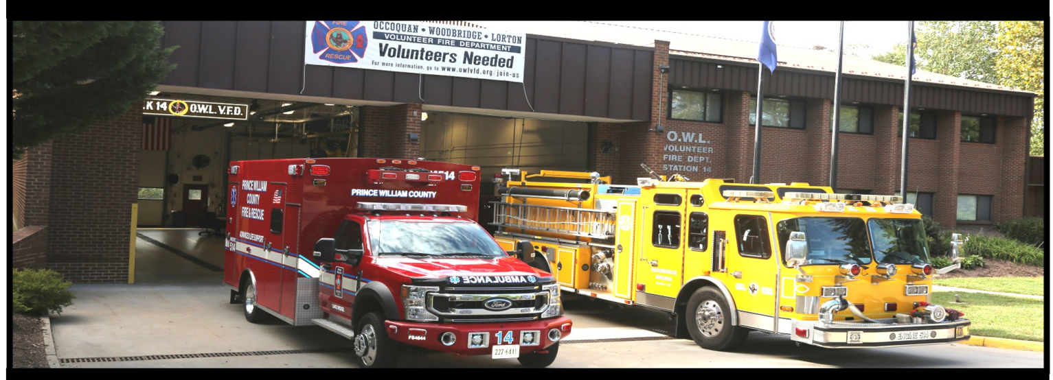
STATION 14 - OCCOQUAN-WOODBRIDGE-LORTON (LAKE RIDGE)