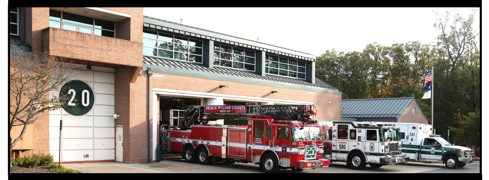
STATION 20 — DALE CITY VFD (BUCHANAN)