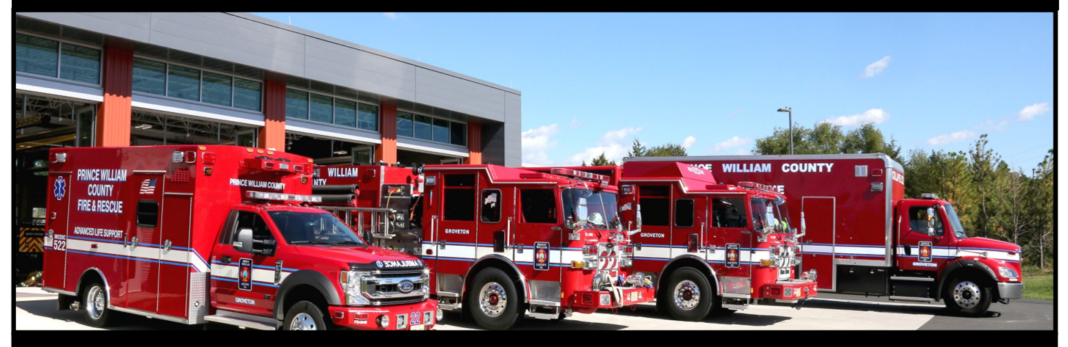
STATION 22 - PWCDFR (GROVETON)