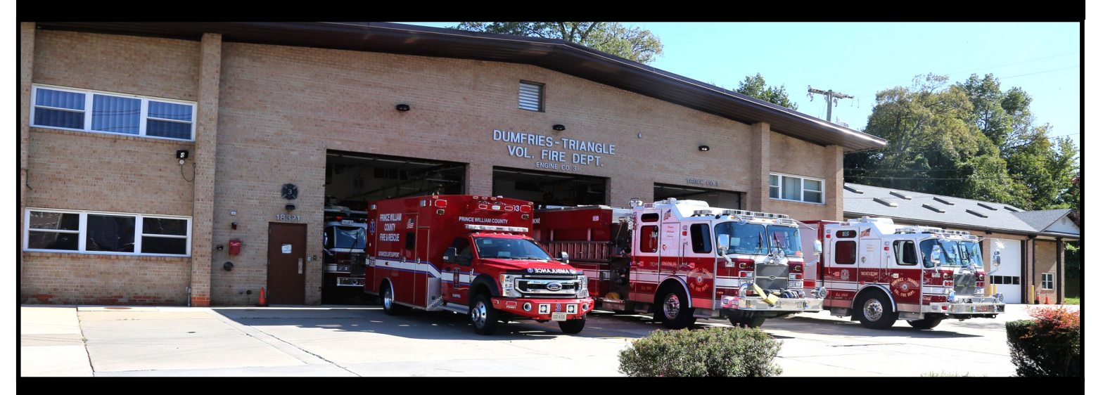
STATION 3 (3 FIRE) - DUMFRIES-TRIANGLE VFD