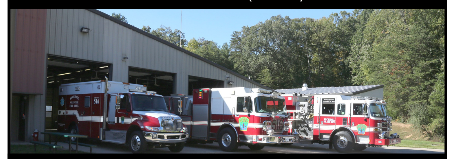
STATION 16 - BUCKHALL VFD