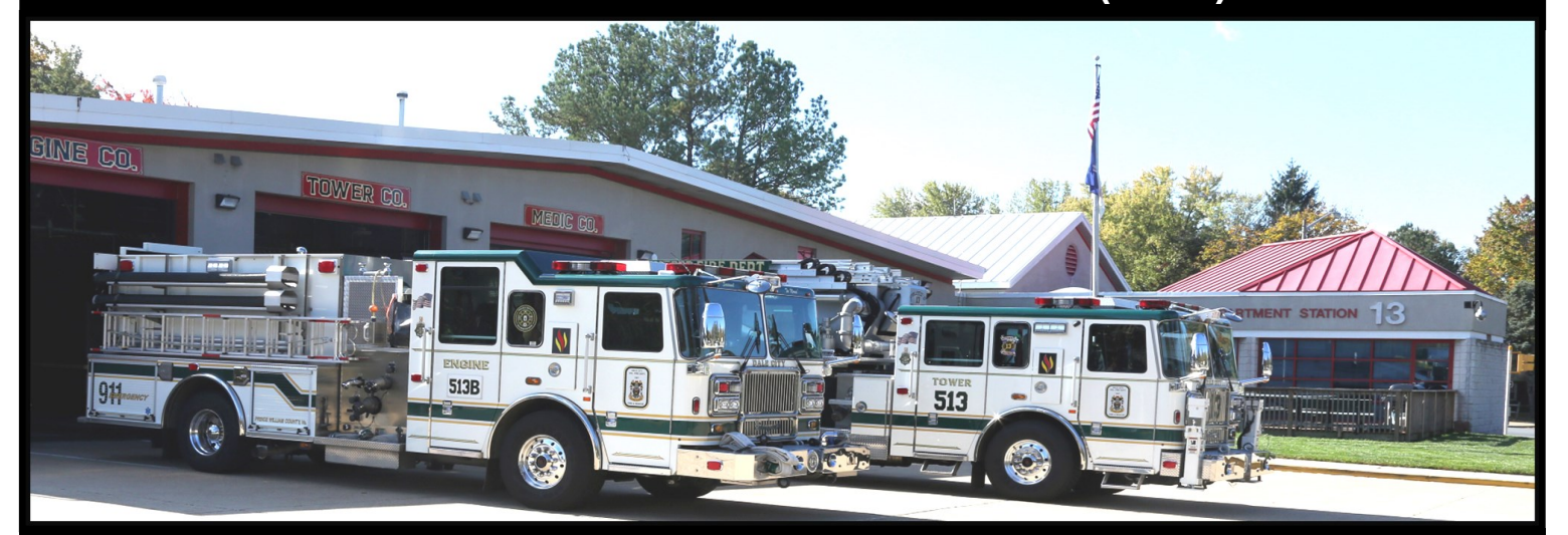
STATION 13 — DALE CITY VFD (HILLENDALE)