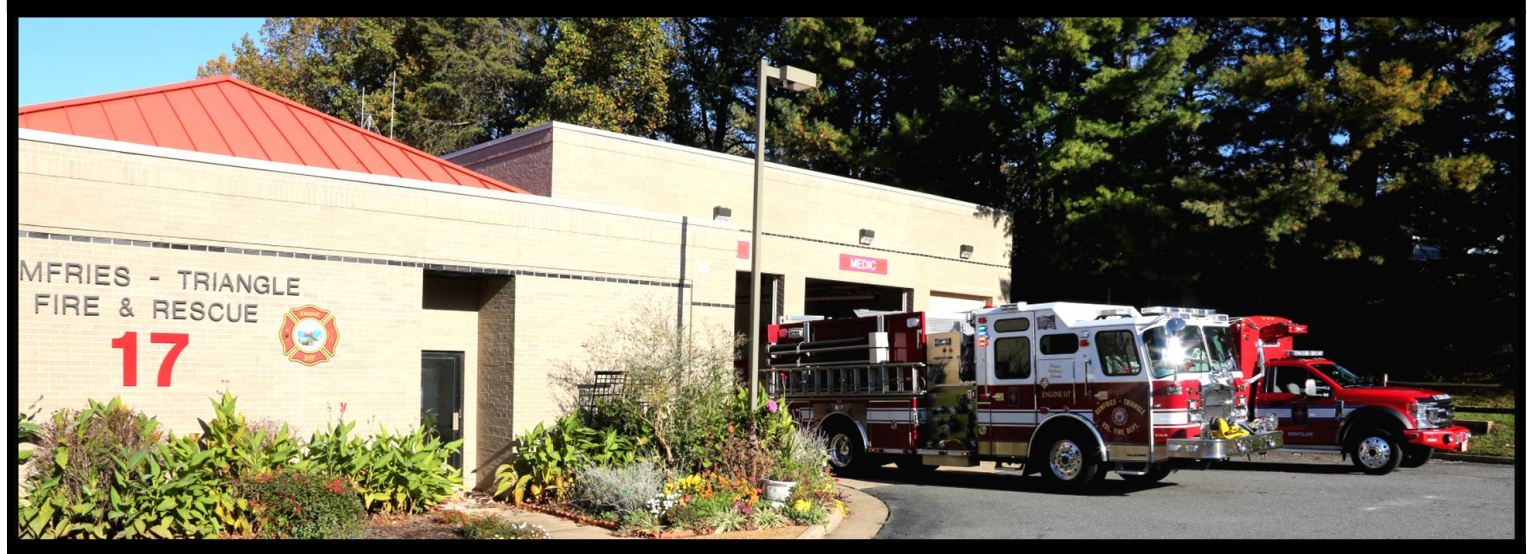
STATION 17 - DUMFRIES-TRIANGLE VFD (MONTCLAIR)