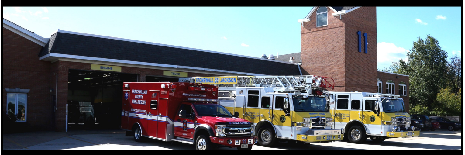
STATION 11 — STONE HOUSE VFD