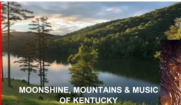
MOONSHINE, MOUNTAINS & MUSIC OF KENTUCKY