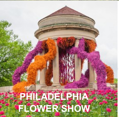
PHILADELPHIA FLOWER SHOW