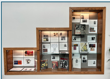
PWC's 2024 BHM Display Case at James J. McCoart Building