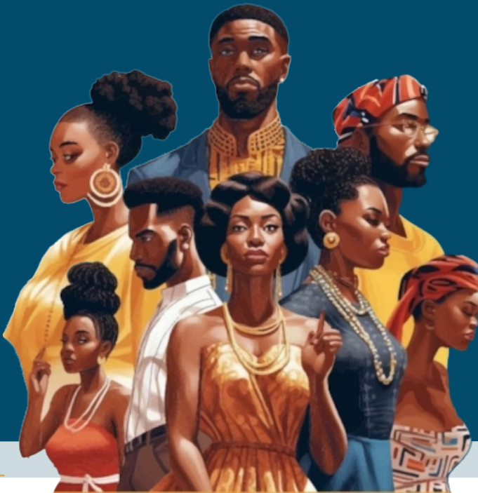
Exhibit Opens: 11AM Ceremony Begins: 12PM

Hylton Performing Arts Center Gregory Family Theatre