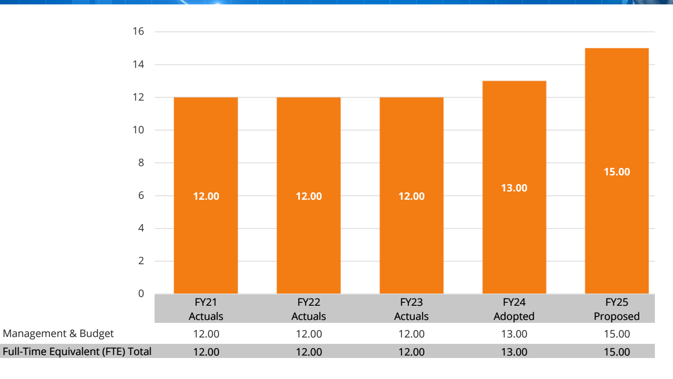
Staff History by Program