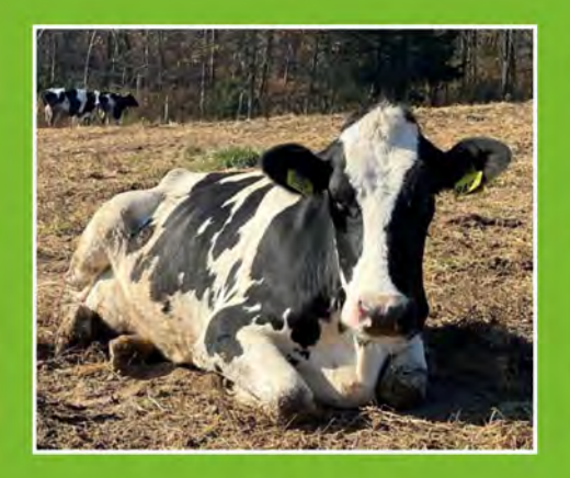
Great to see you again kids!