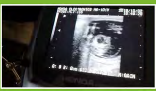
Utah's Update Dair

Below is a screenshot of an ultrasound. Veterinarians sometimes use this to check if cows are pregnant.