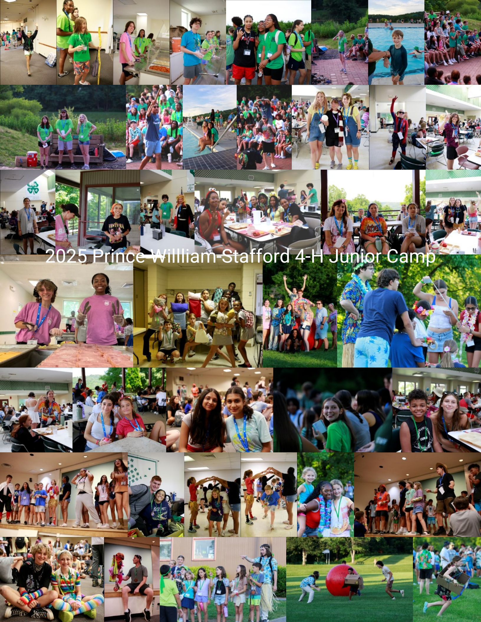
2025 Prince William-Stafford 4-H Junior Camp