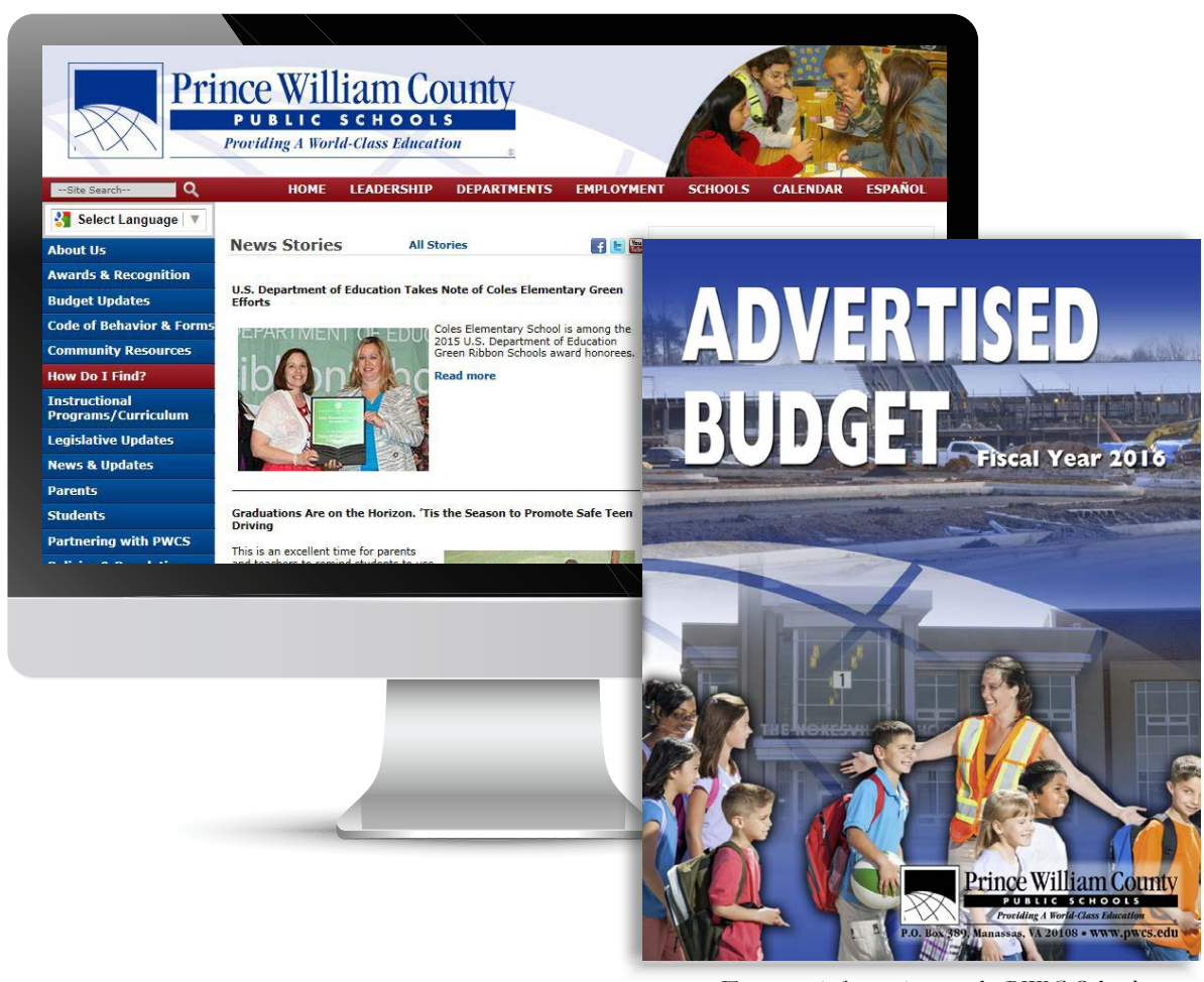
For more information on the PWC Schools, visit www.pwcs.edu.