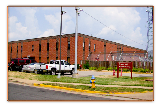
Adult Detention Center Phase I Expansion

Adult Detention Center Phase I Expansion - The replacement of the existing station with a modern, 18,500 square foot facility.