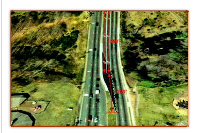
Dale Boulevard/Benita Fitzgerald Drive

Dale Boulevard/Benita Fitzgerald Drive Intersection Improvements - This project extended dual left turn lanes from Dale Boulevard onto Benita Fitzgerald Drive, which will help alleviate congestion during peak morning and evening travel periods as well as improve safety.