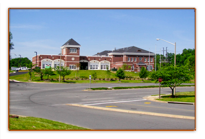
River Oaks Fire and Rescue Station

River Oaks Fire and Rescue Station - The River Oaks Fire and Rescue Station is located near the intersection of River Ridge Boulevard and Route 1. The station is equipped with a pumper, tanker, rescue squad, basic life support and an advanced life support ambulance. The construction of this station will improve response times in the area while also easing emergency call volumes on other stations.