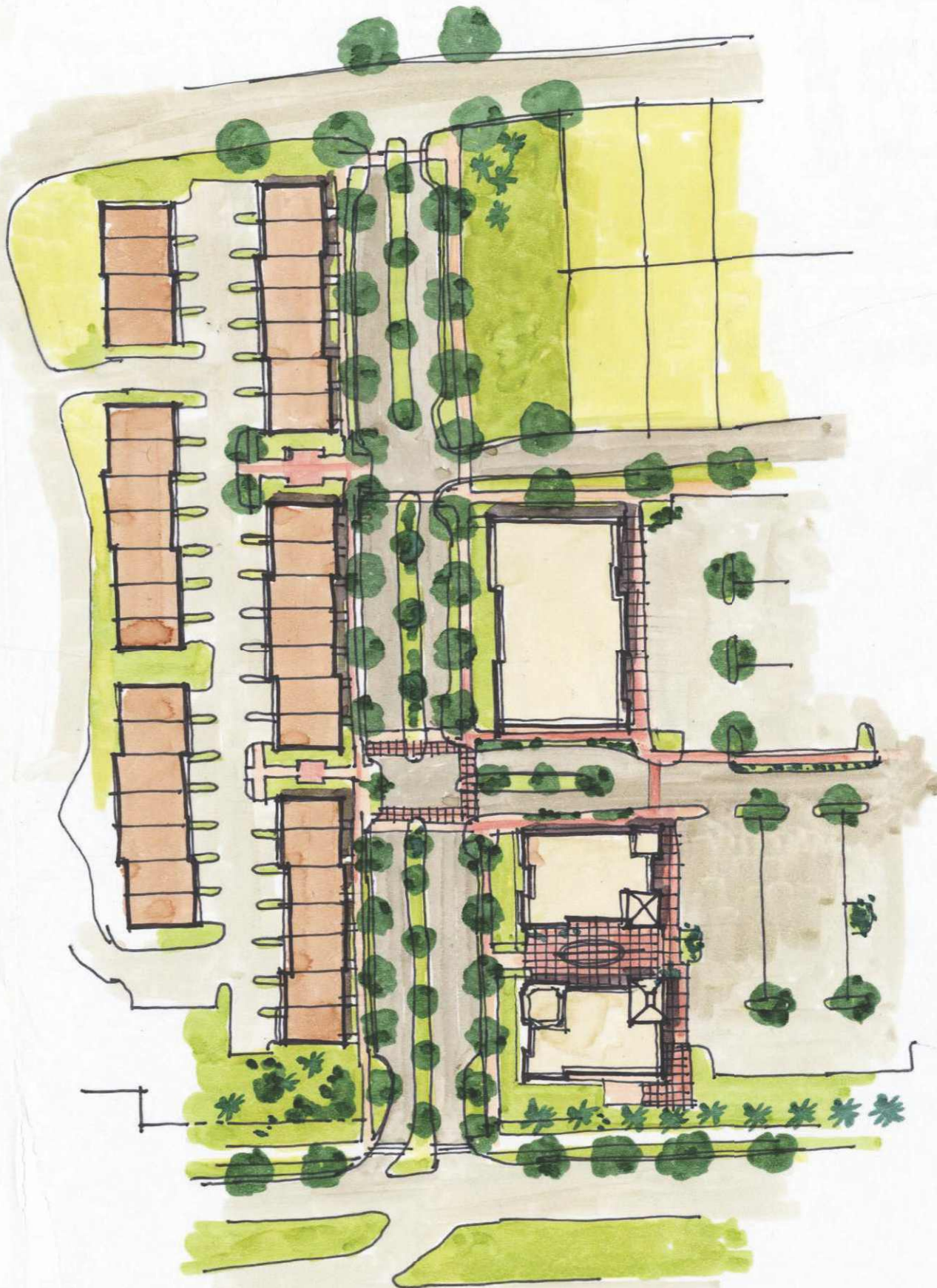
Sketch Site Plan Detail Approximate Scale: 1"=100'