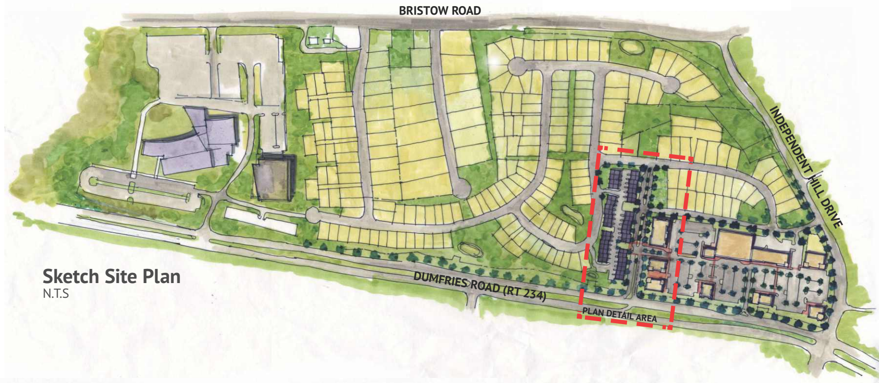
Sketch Site Plan N.T.S