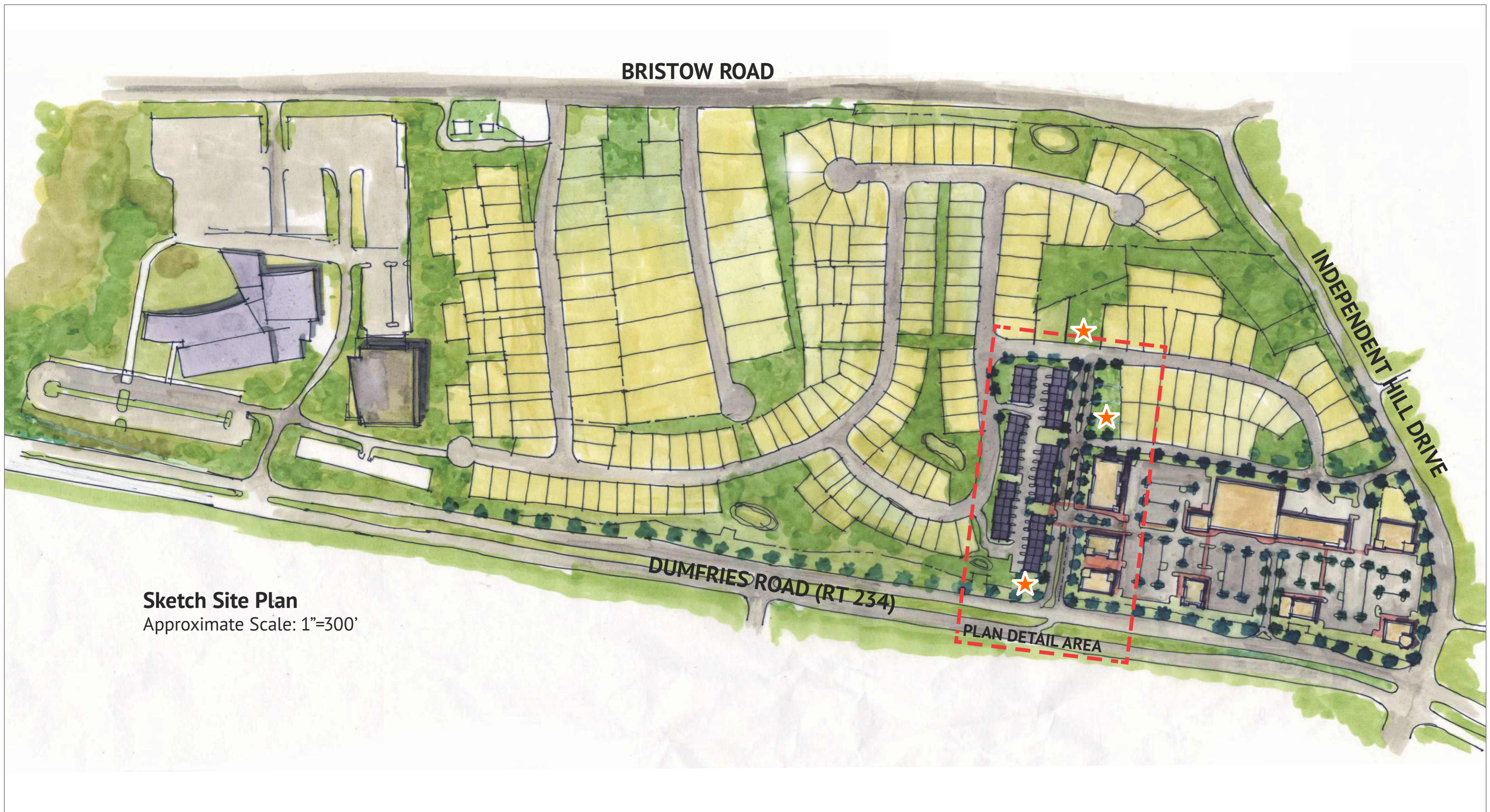
Sketch Site Plan Approximate Scale: 1"=300'