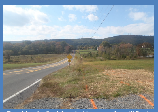
From Meander Creek Lane looking west at Logmill Road