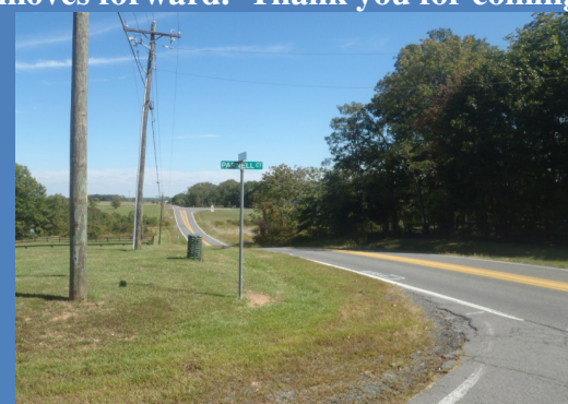
From Parnell Court looking east at Logmill Road

We look forward to working with you as the project moves forward. Thank you for coming!