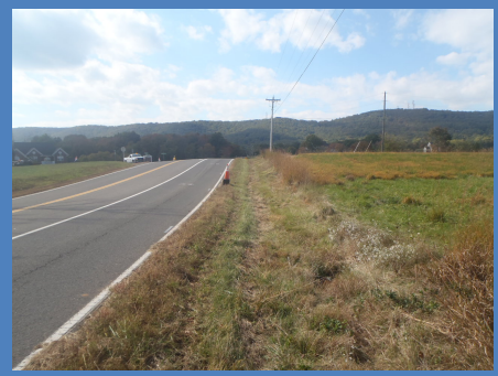
From the east end of the project looking west

Project plans and other information will remain available for review at the PWC Department of Transportation office located in Prince William, Virginia.