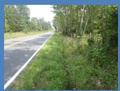
From the west end of the project looking east

On August 19, 2013, the public comment period will close. PWC staff will then review and evaluate all comments received as a result of the citizen information meeting. Once public input has been reviewed, the project will be presented to the PWC Department of Transportation who will consider approval of the project's major design features. Upon approval of the major design features, the project will proceed to the final design phase, and given to VDOT for final approval.