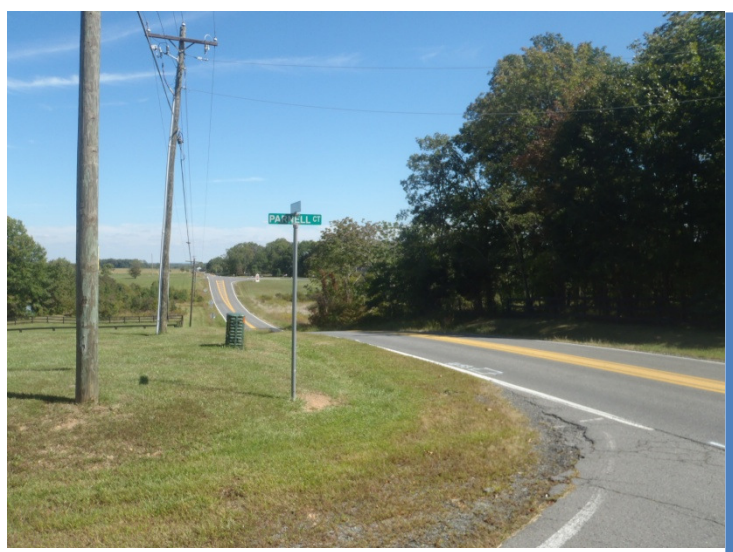
From Parnell Court looking east at Logmill Road