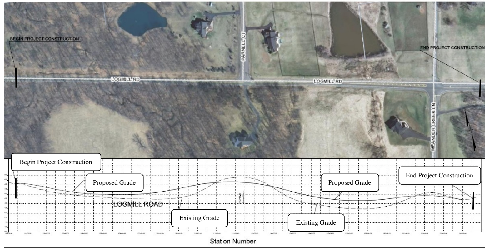
Aerial Photography from Prince William County Online Mapper (July 2012) Provided Courtesy of the Commonwealth of Virginia (2011)