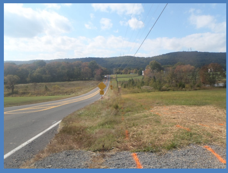
From Meander Creek Lane looking west at Logmill Road

We look forward to working with you as the project moves forward. Thank you for coming!