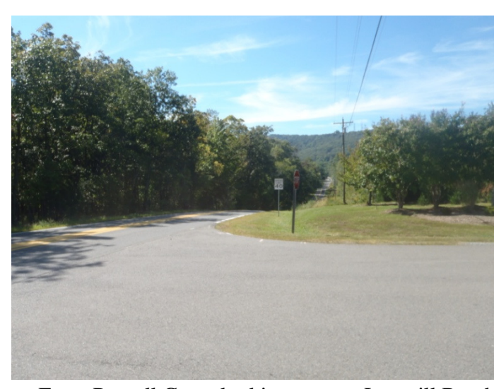
From Parnell Court looking west at Logmill Road

Preliminary Engineering - $488,000 Right of Way and Utility Relocations - $200,000 Construction - $2.5 million