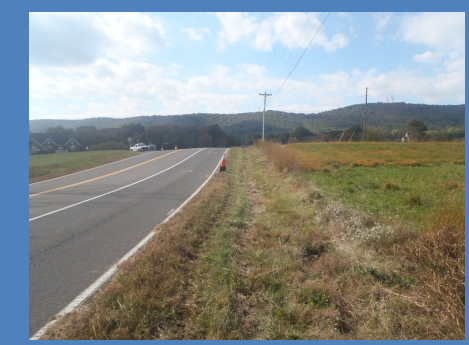
From the end of the project looking west at Logmill Road

Estimated Construction Completion Early 2014