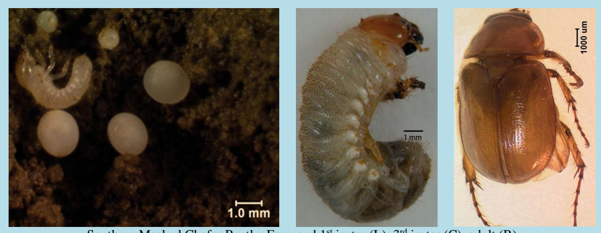
Southern Masked Chafer Beetle: Eggs and 1<sup>st</sup> instar (L), 3<sup>rd</sup> instar (C), adult (R) Biology, Ecology, and Management of Masked Chafer (Coleoptera: Scarabaeidae) Grubs in Turfgrass, Journal of Integrated Pest Management, 2016.