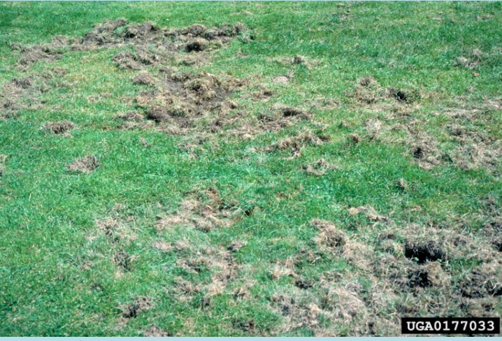
Scratching up of turf by birds, skunks or raccoons can indicate a grub problem