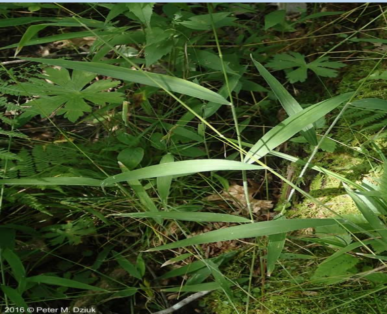
Photo: Virginia Cutgrass leaves.

Virginia Cutgrass ( Leersia virginia ) is a native which can grow intermingled with stiltgrass. Deer-Tongue grass is native to eastern North America.