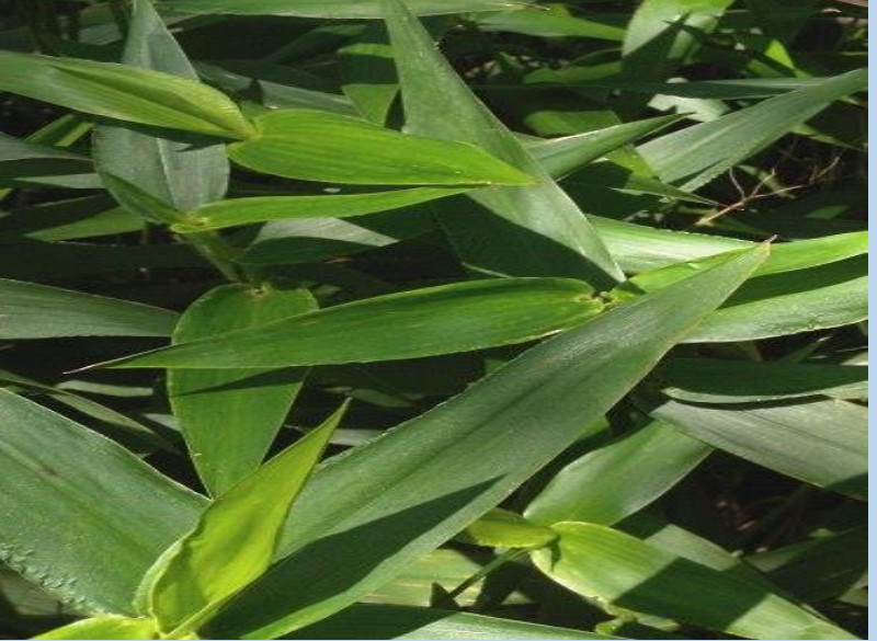
Photo: Deer-Tongue grass, https://www.illinoiswildflowers.info/grasses/plants/deertg_grass.html