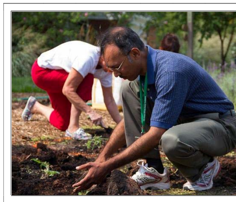
Master Gardener Volunteers at our Teaching Garden on the grounds of the Benedictine Monastery on Linton Hall Road.

After the internship, volunteers become certified Master Gardeners. To remain an active Master Gardener you must contribute 20 hours per year and also earn 8 hours of continuing education each year.