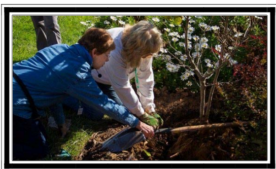
Master Gardener Volunteers at our Teaching Garden on the grounds of the Benedictine Monastery on Linton Hall Road.

Master Gardeners in Prince William serve the communities of Prince William County, and the Cities of Manassas, and Manassas Park.